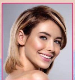
Don't Miss Our Next Edition!